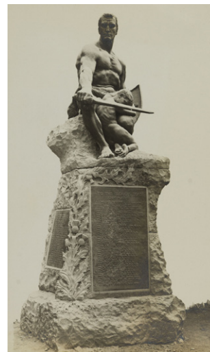
Top: Proposed design for Berkshire War Memorial, Reading (not built), 1919 (D/EWK/Bz/3/2/1/1) Left: Statue used as model for Caversham war memorial, 1921 (D/EWK/Bz/3/2/3/1/4)