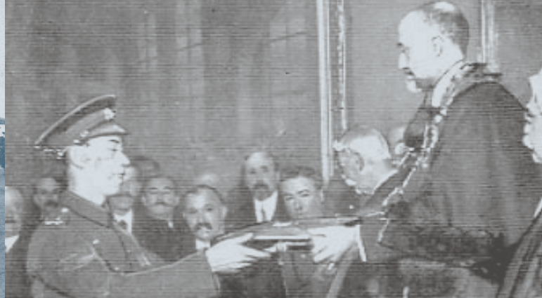
Top left: Ambulances collecting wounded soldiers at Reading Station, 1915 (D/EX588/1) Top right: Trooper Fred Potts of the Berkshire Yeomanry is awarded the Victoria Cross (D/EX588/1)