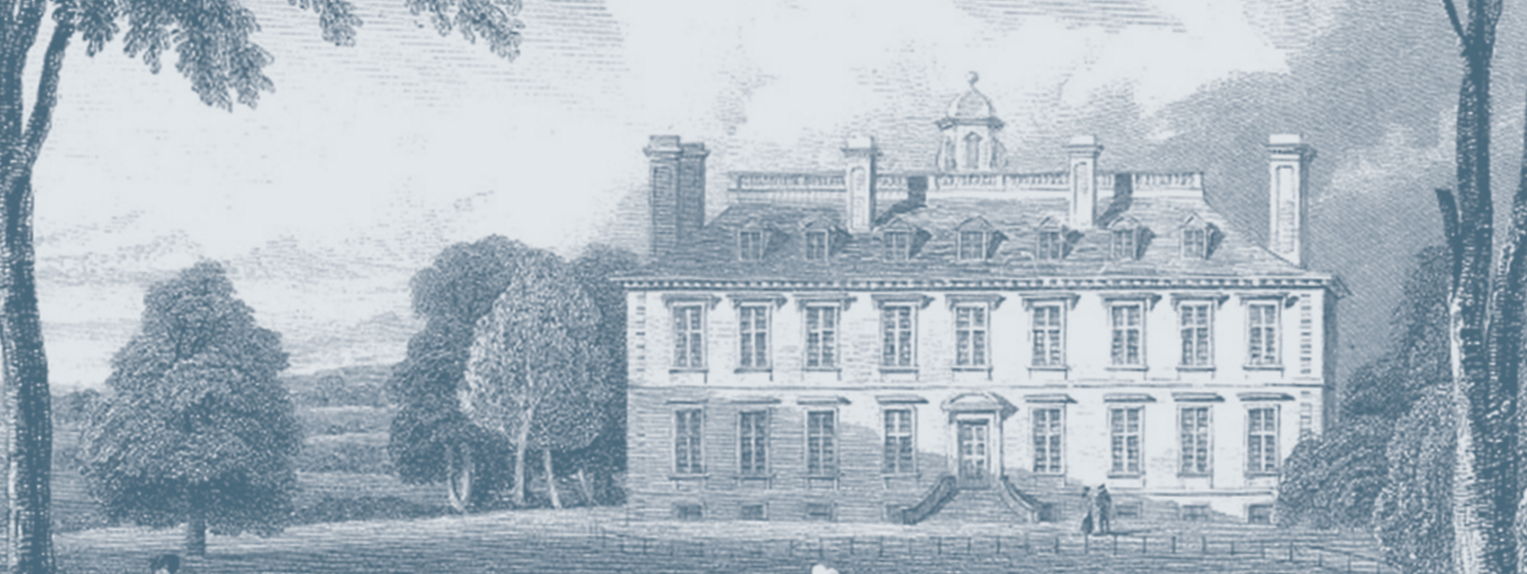
Top: Coleshill House in 1822 (D/EX130/3/10/2)